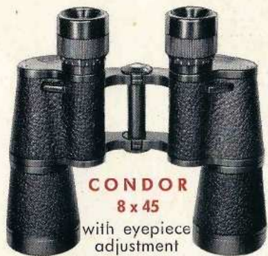
CONDOR 8 x 45 with eyepiece adjustment