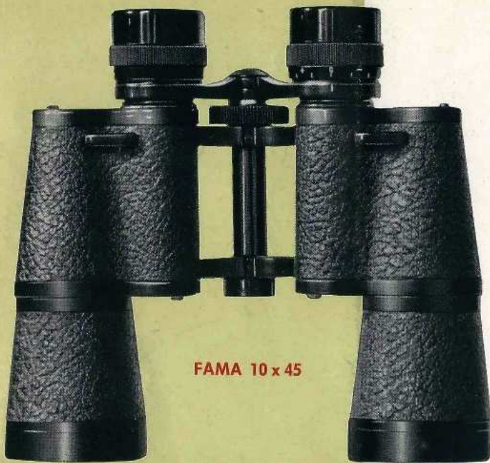
FAMA 10 x 45