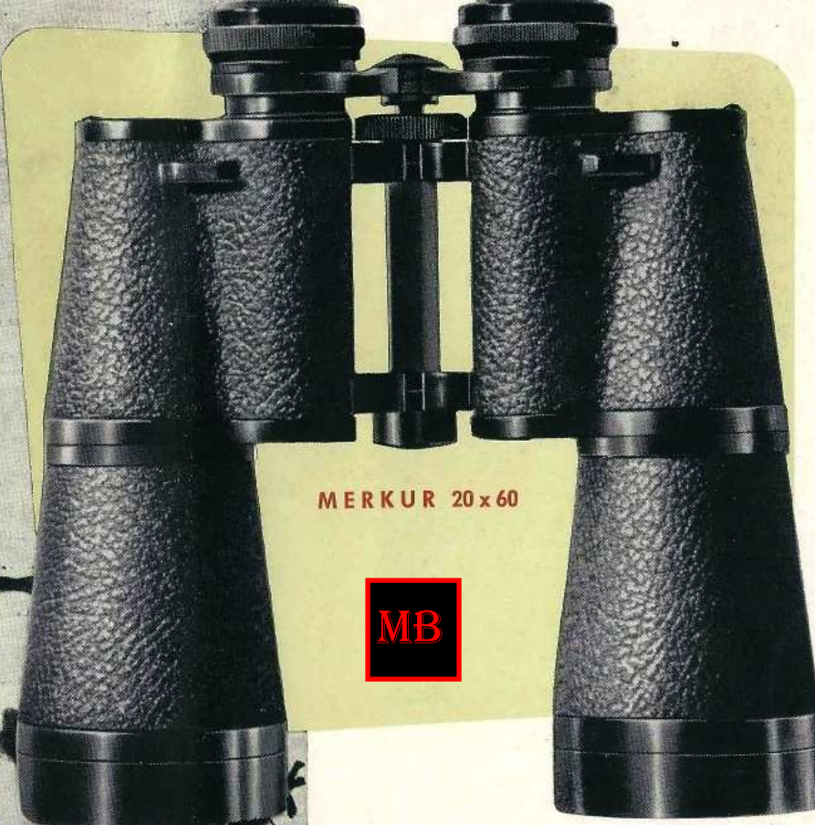
MERKUR 20 x 60