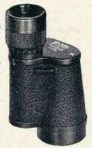
BESO 6 x 30 Monocular

Prism binoculars of all models, with the exception of "KOBOLD" and "KOLIBRI", are also available as monoculars. These glasses are particularly suitable for use over short periods only for the accurate recognition of details. The monoculars "SATURN" and "MERKUR" are fitted with a threaded bridge, so that they can be mounted on any tripod or suitable walking or shooting stick. They replace the old-fashioned telescope and are more convenient to handle, have a larger field of view and their image is brighter and more brilliant at a remarkable magnification. Monoculars are supplied in soft leather cases.