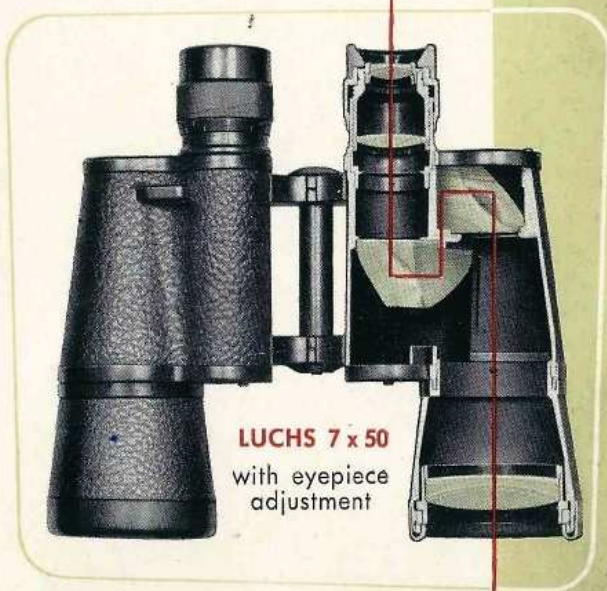
LUCHS 7 x 50 with eyepiece adjustment