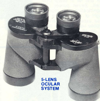
5-LENS OCULAR SYSTEM

823 COMMODORE MK II Wide Angle 7x, 50 C.F.—525 ft.—40 oz.—R.L.E. 84.2.—The contemporary version of the traditional deck officer's night glass. 7.14mm exit pupil and a high relative light efficiency of 84.2 give this binocular extraordinary light gathering properties. The field of view is 525 ft. Its weight is 40 oz. with center focusing down to 15 ft.