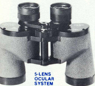
5-LENS OCULAR SYSTEM

surround viewing. Slotted prisms, solidly secured with precision Phosphor-Bronze clamps, prevent diffusion and enhance image definition. These superb optics are housed in a seamless monobloc body of ultra-light alloy. Complete with case.