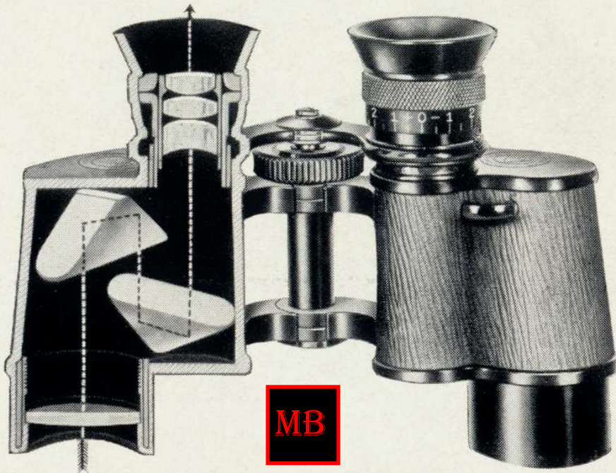
Sectional View, Showing Prism Construction and Path of Light Ray

evenness of illumination and clarity of definition not obtainable in the old style straight type.